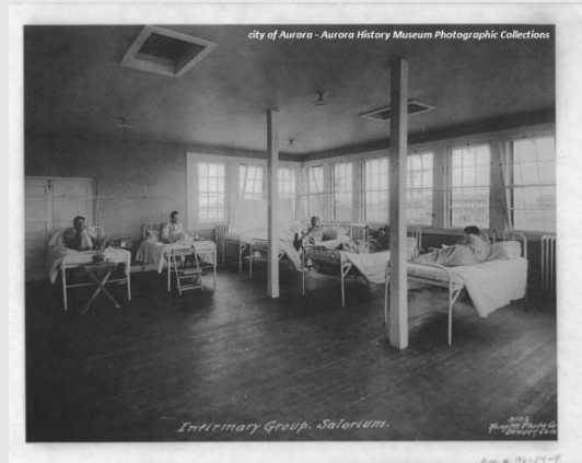
Photo "Infirmary group Solarium", city of Aurora, Aurora History Museum Collections. Fitzsimmons box 1, folder 2

Fitzsimmons and Military History: variety of sources, some text and photos